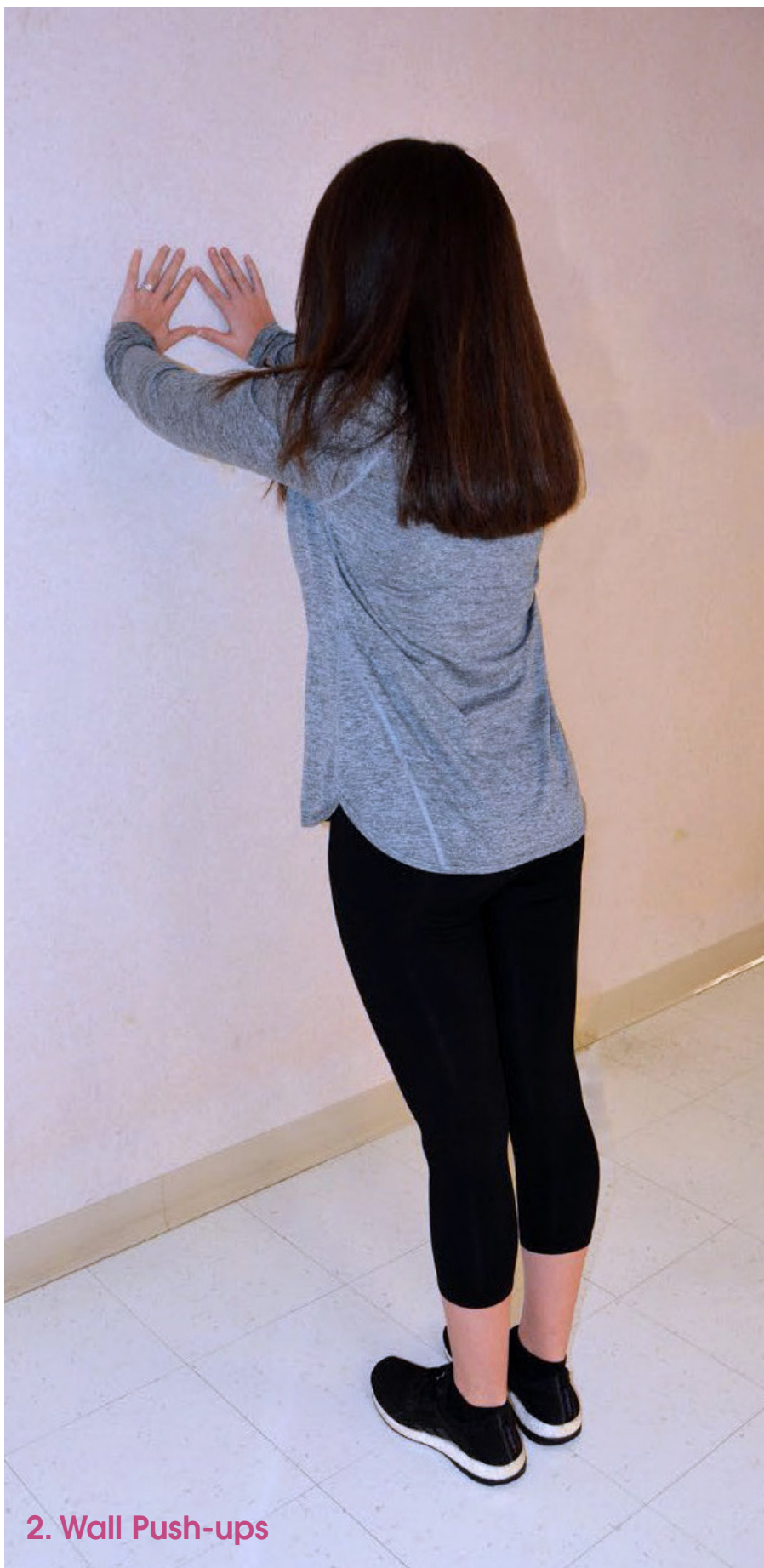
2. Wall Push-ups