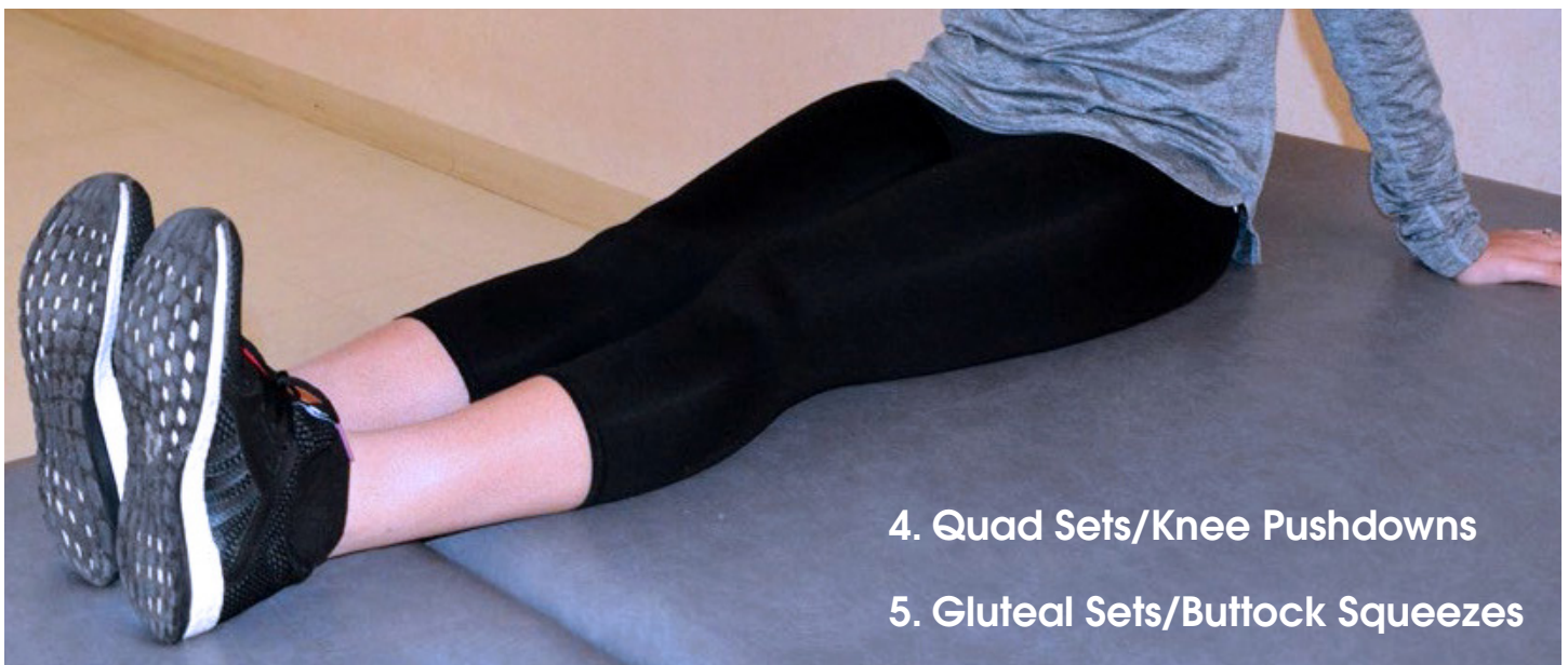
4. Quad Sets/Knee Pushdowns