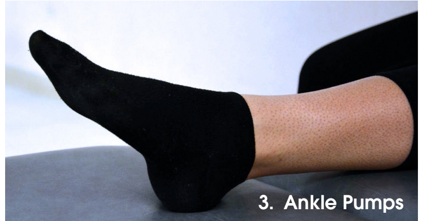
3. Ankle Pumps