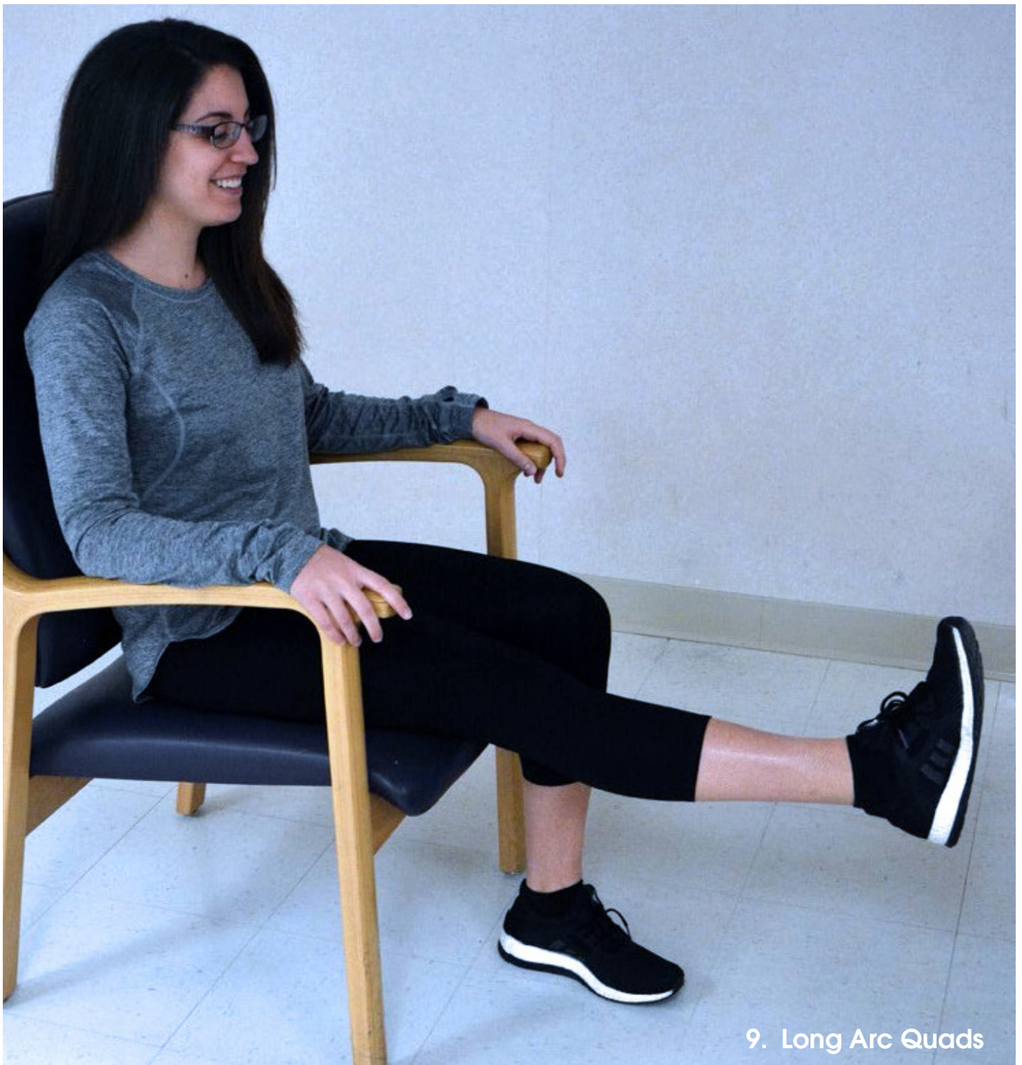
9. Long Arc Quads