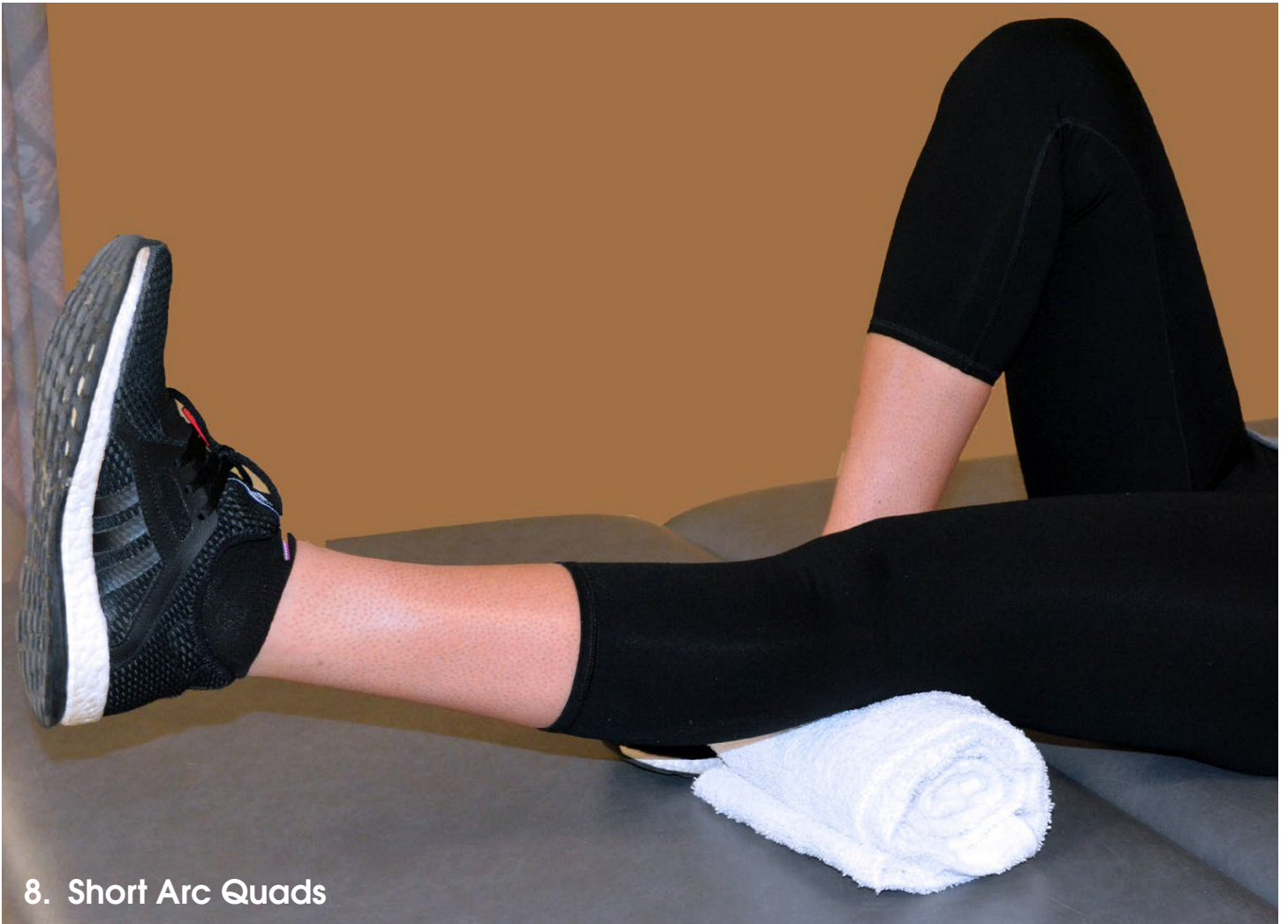
8. Short Arc Quads