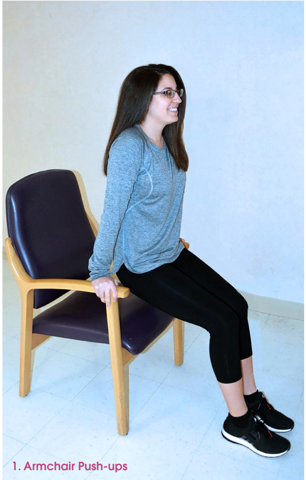
1. Armchair Push-ups